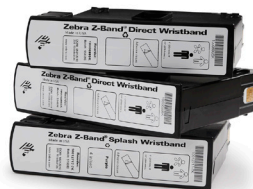
Z-Band Wristband Cartridges for ZD510-HC 10015355K (White), 10015355-2K (Blue), 10015355-3K (Green), 10015355-5K (Pink)