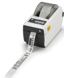
ZD410-HC ZD41H22-D01E00EZ (Ethernet, USB, BTLE) ZD41H22-D01W01EZ (USB, 802.11ac, Bluetooth 4.0)