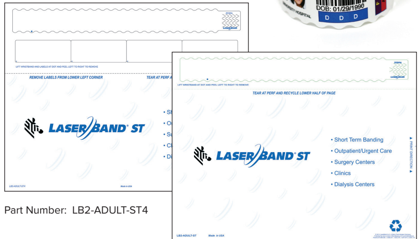
Part Number: LB2-ADULT-ST4

Specifications subject to change without notice.