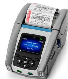
ZQ610-HC ZQ61-HUWA000-00 (WiFi Model)