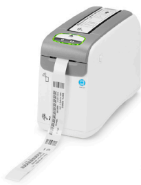
ZD510-HC ZD51013-D01E00FZ (Ethernet Model) ZD51013-D01B01FZ (WiFi Model)

Enable quick identification of special patient conditions with color-coded wristbands from Zebra. Available by cartridge for ZD510-HC, or rolls which are compatible with standard desktop printers.